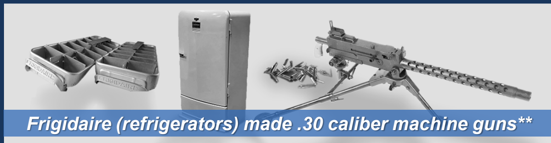
Frigidaire (refrigerators) made .30 caliber machine guns**