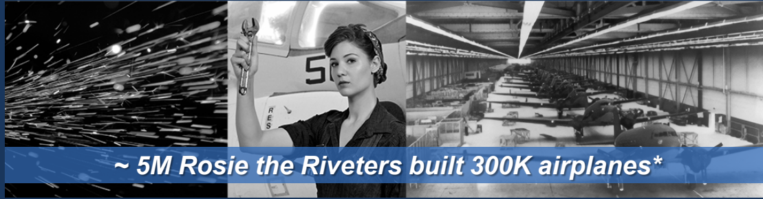
~ 5M Rosie the Riveters built 300K airplanes*

Our initiative is to provide next gen opportunities to exceed current and future warfighting capabilities. In WWII, DoD and private industry established non-traditional roles to create a manufacturing juggernaut that hasn’t been seen since.