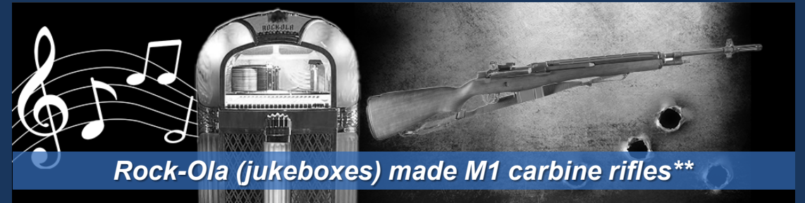
Rock-Ola (jukeboxes) made M1 carbine rifles**

To ensure the United States Air Force is prepared to fight and win the next war, the AFSC is on a journey to take on non-traditional roles with private industry to assemble and manufacture commodities in-house.